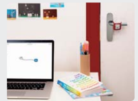
Design & Technology